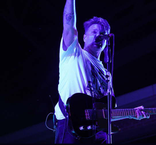
Downtown Rising 2022 ft. COLD WAR KIDS