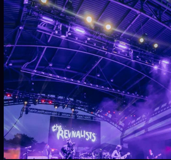
Downtown Rising 2019 ft. THE REVIVALISTS