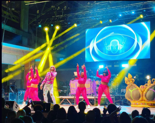
Downtown Rising 2021 ft. TANK AND THE BANGAS BIG FREEDIA